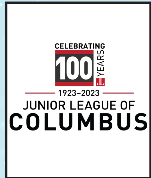
Junior League of Columbus

Black Girl Rising Inc. and the Junior League of Columbus, both Columbus non-profit organizations, have joined together to lift up African American girls in the Columbus area.