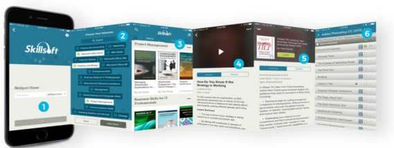
1. LOGIN 2. INTEREST AREAS 3. HOME PAGE 4. VIDEOS 5. AUDIO BOOKS 6. COURSES