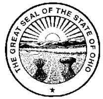
John R. Kasich Governor