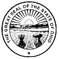
John R. Kasich Governor